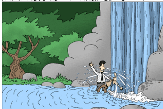
THIS GUY NEEDED THE MAXIMUM BAPTISM PACKAGE